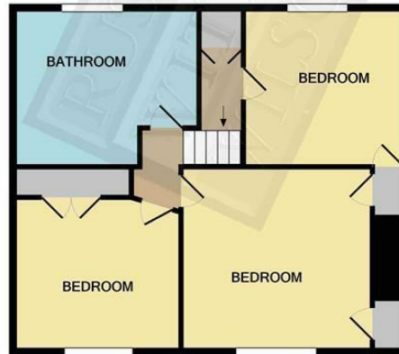
1ST FLOOR APPROX. FLOOR AREA 511 SQ.FT. (47.5 SQ.M.)